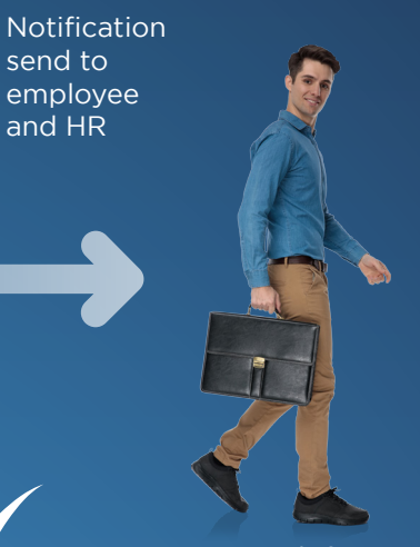
Touch free, contactless & hassle free attendance marked ensuring social distancing